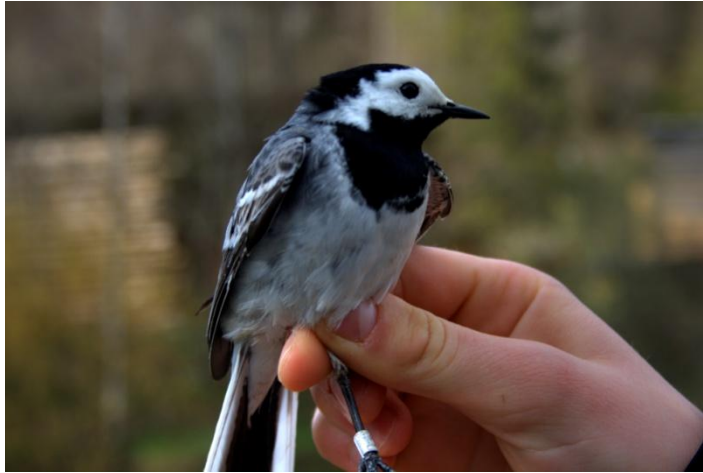
13. April -M- Ad. Cod.6